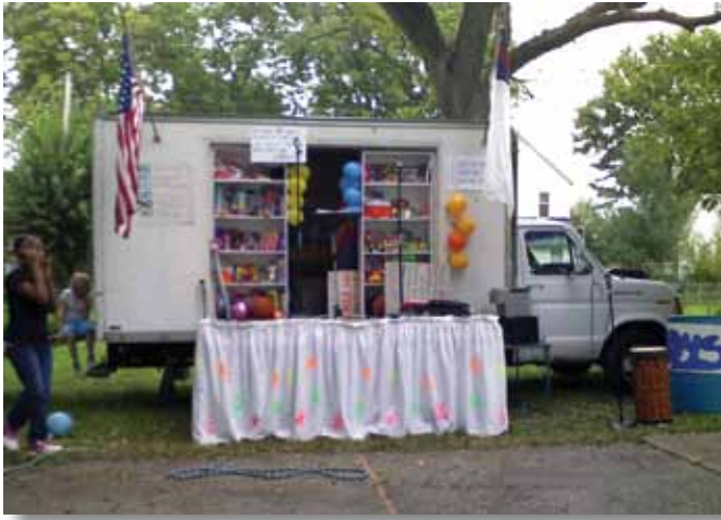
Hands of Jesus converted this truck into a mobile church!

kids live with them temporarily, to mention just a few. Hands of Jesus also works with other ministries who are better able to take care of some needs.