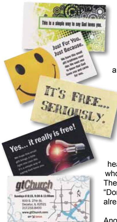
Samples of a few GT Church DNA cards they distribute

At Starbuck's a similar scene unfolds as car after car makes the decision to follow the lead of someone earlier in the day. Each individual looks at the GT DNA card they receive and a smile breaks out. "I'd like to pay for the order behind me and please give them this card."